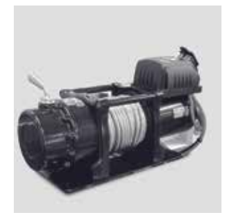
Electric Winch 4500lb (2100kg) Ask your local distributor for details.