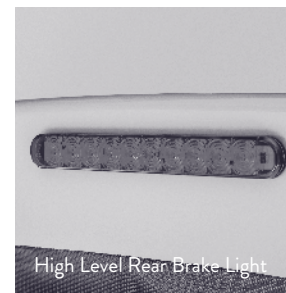
High Level Rear Brake Light

Optional accessories have been priced as factory fit items, ordered with your trailer. If ordered at a later date, your distributor may need to fit the items, which could result in fitting charges being incurred. Dimensions and weights are given as a guide only. We reserve the right to alter specifications without notice. © Ifor Williams Trailers Ltd 2018. All rights reserved.