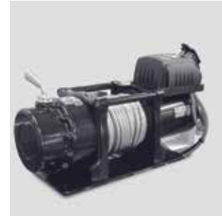
Electric Winch 4500lb (2100kg) Ask your local distributor for details.

Extra high ramps (3' High) - CT166 £169 - CT167 £216. Manual winches not available on CT models.