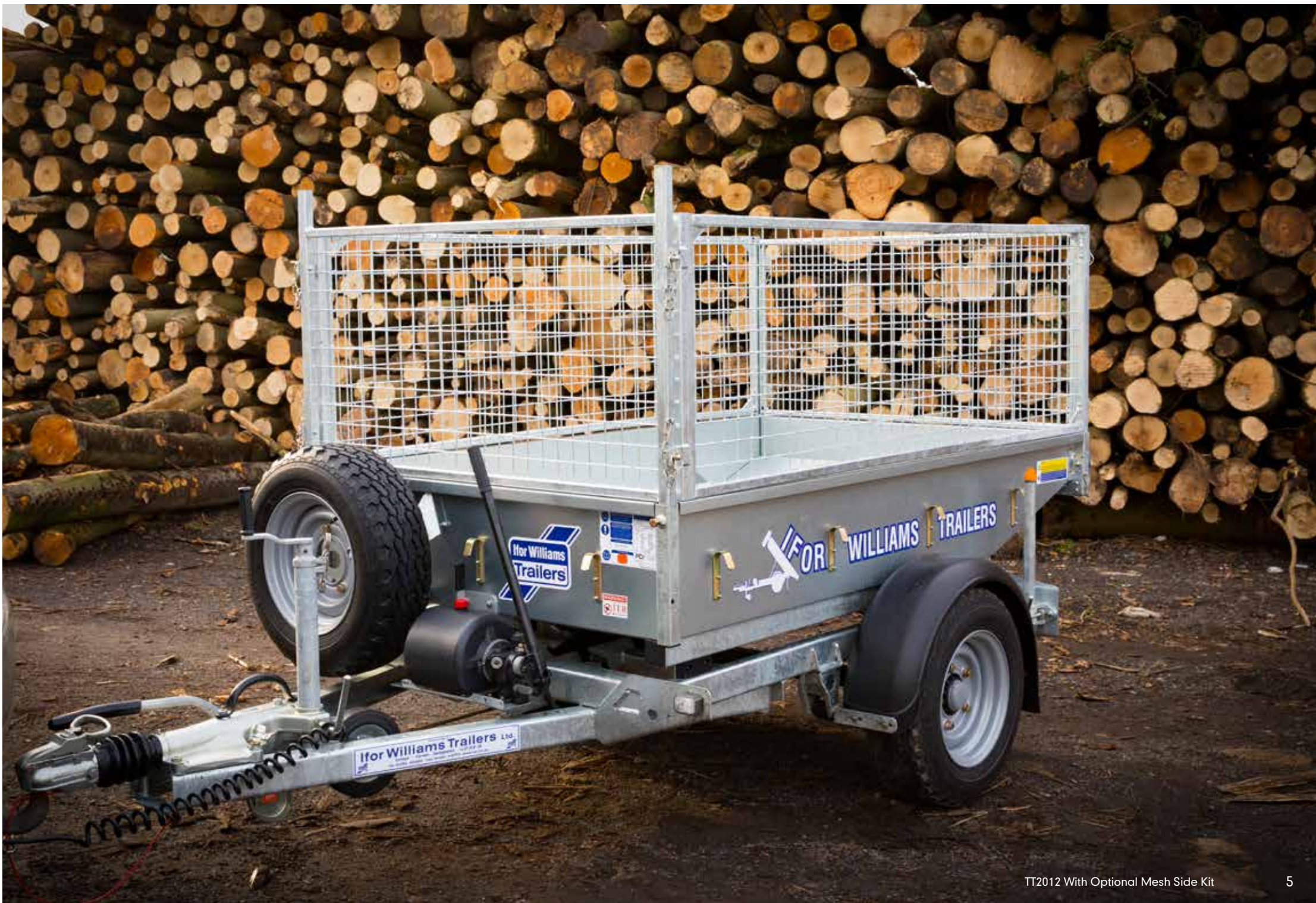
TT2012 With Optional Mesh Side Kit