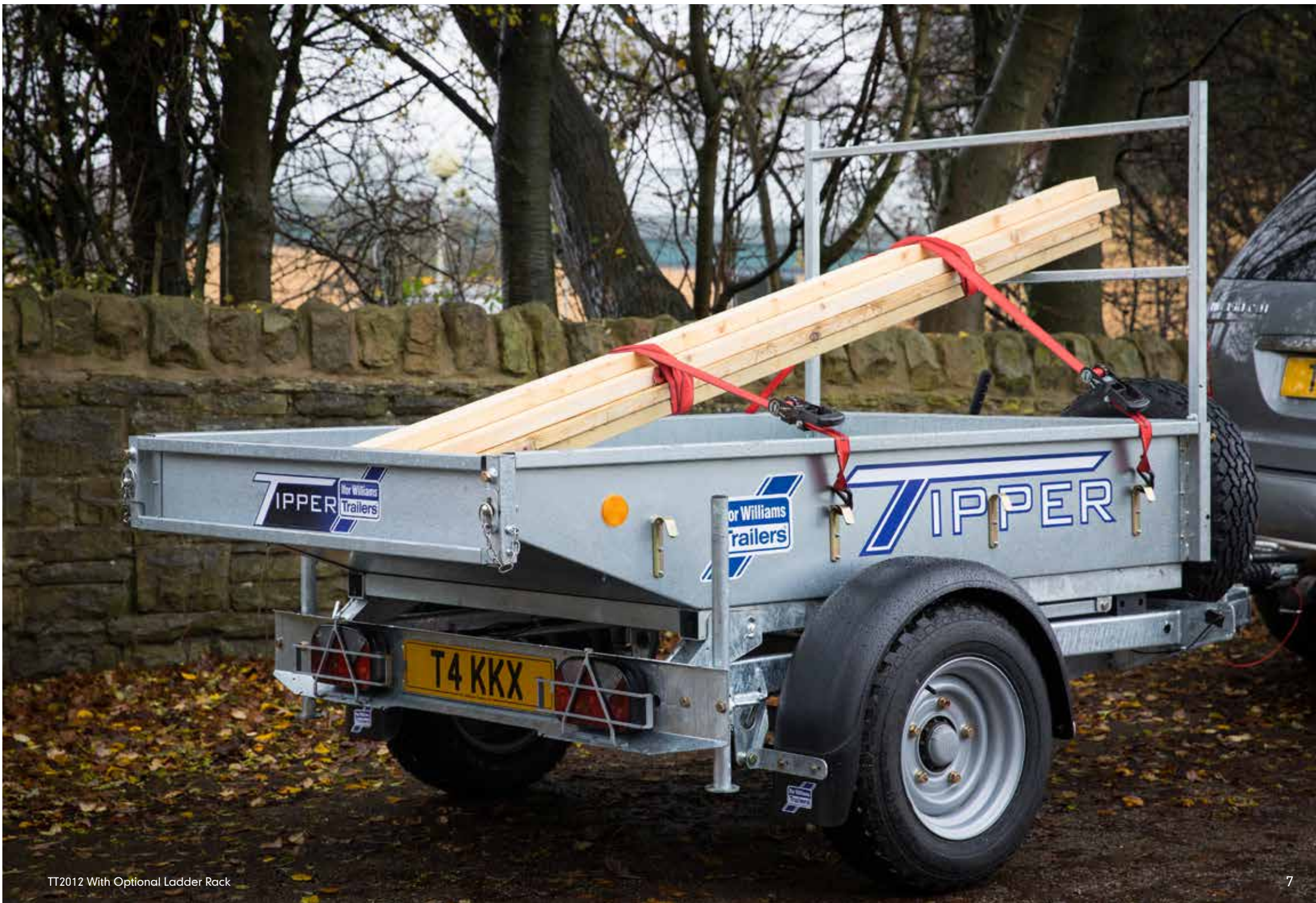
TT2012 With Optional Ladder Rack